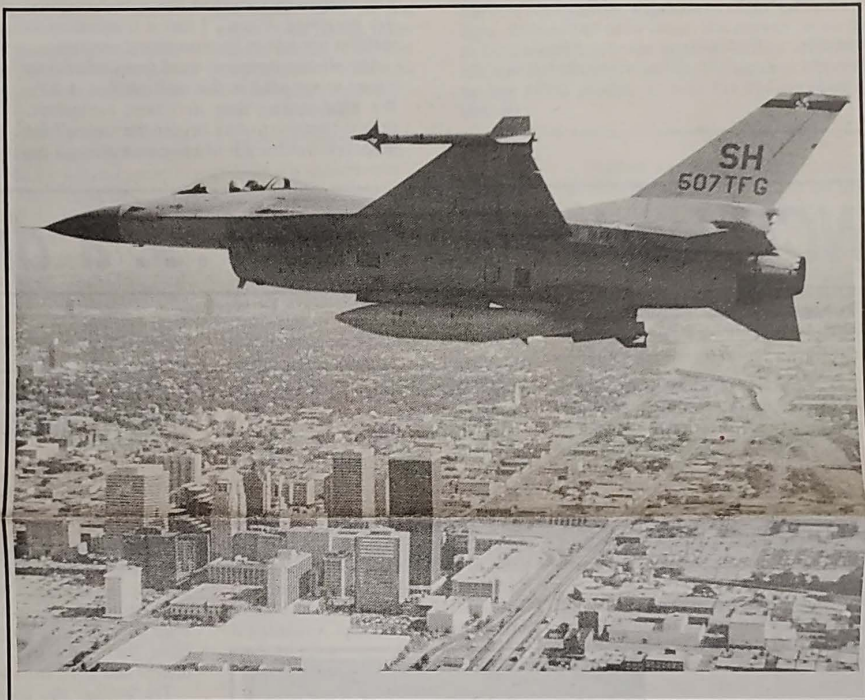
Aircraft 507 flies over the downtown Oklahoma City area. The 507th TFG became an F-16 unit Jan. 1. Its conversion now completes the circle with the 944th TFG and the 419th Tactical Fighter Wing to complete the only Air Force Reserve F-16 Fighting Falcon wing.

In the air-to-surface role, the F-16 can fly more than 500 miles, deliver its weapons with superior accuracy, defend itself against enemy aircraft and return to its starting point.